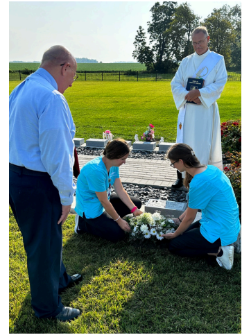
A dignified hospital burial at Morgan's Place Cemetery's Hospital Section.

Please continue to have conversations with your local hospital and medical professionals about these under 20 week babies. Currently 4 out of the 5 local hospitals in our area that we have reached out to are still choosing to incinerate babies and dispose of them instead of offering a dignified burial. Please pray for these hospitals that they understand that every baby, no matter their size or gestation deserves a dignified burial. This policy change would also allow for parents to visit their baby and know where the remains of their baby are once they have had time to process their grief.